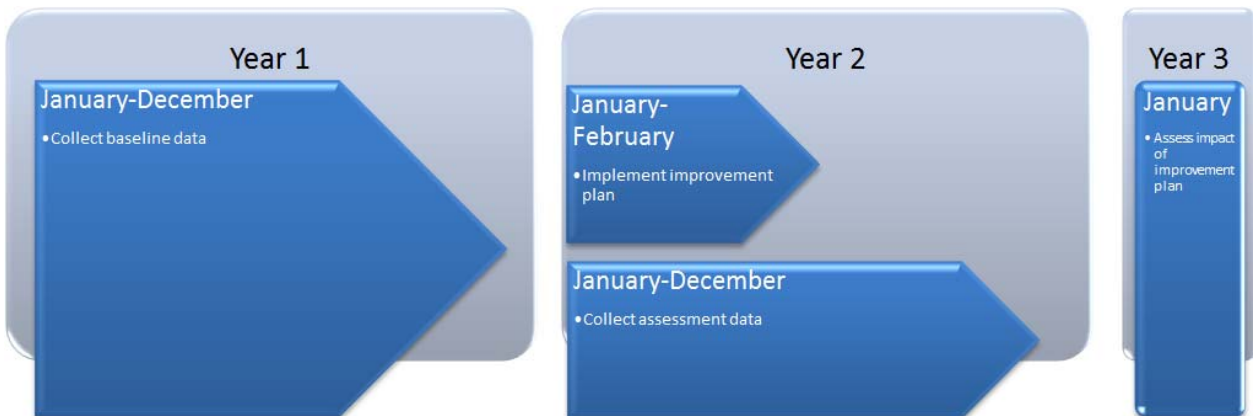
Timeline for PQI Plan without Follow-up Data (Measure 4)