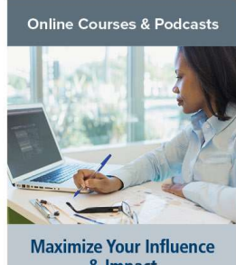
Maximize Your Influence & Impact Power Hour Webinar Series RLI Taking the Lead Podcast