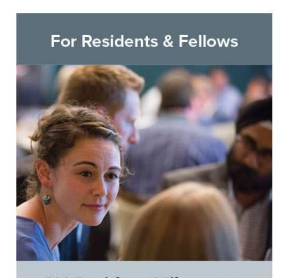
RLI Resident Milestones Kickstart Your Career Leadership Essentials