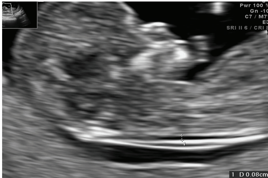
Diagram for the nuchal translucency measurement.